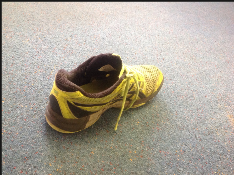
Jane incorporation supplied shoe.